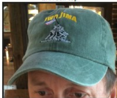
IJAA Ball Cap