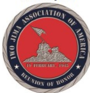
IJAA Challenge Coin