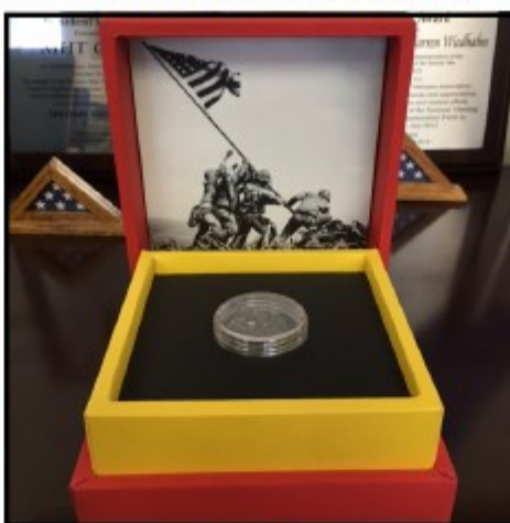
Iwo Jima Memorial Display Box w/iconic Rosenthal photo & Black Sand Case