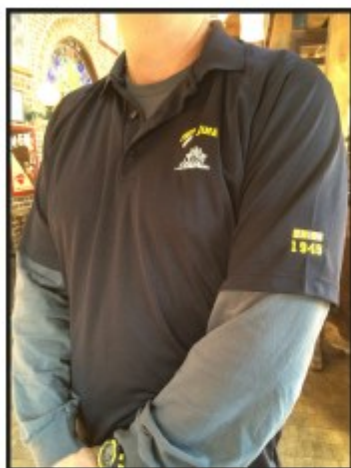
IJAA Polo Shirt