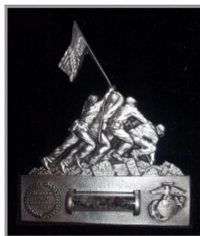
Flag Raising Commemorative Medallion Pewter w/Black Sand Capsule